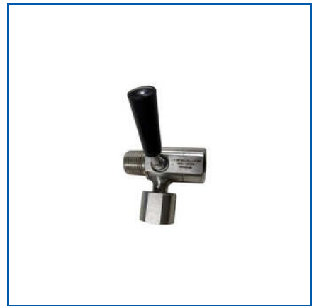
3 WAY GAUGE COCK