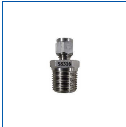
SS316 ADJUSTABLE GLAND