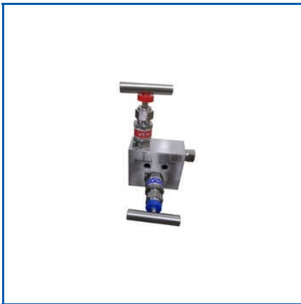
STAINLESS STEEL 2 VALVE MANIFOLD

3 Way Gauge Cock, Coil Type Plain Syphon, Heavy Duty Coil Type Syphon, Heavy Duty U Type Syphon, SS316 Adjustable Gland, Stainless Steel 2 Valve Manifold, U Type Plain Syphon, etc.