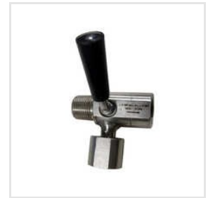
3 Way Gauge Cock