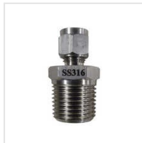
SS316 Adjustable Gland