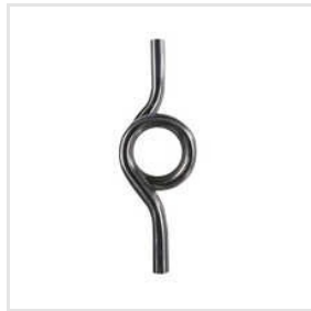
Coil Type Plain Syphon