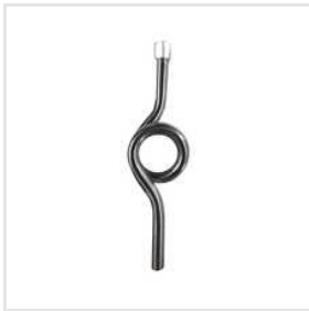
Heavy Duty Coil Type Syphon