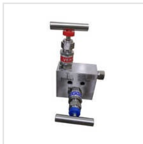
Stainless Steel 2 Valve Manifold