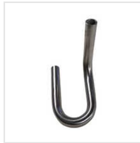
U Type Plain Syphon